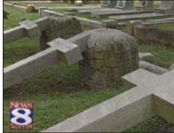
Several trees were cut down at the cemetery Monday.