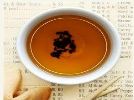
The beginning process of having your tea leaves read

Owl indicates sickness or poverty. It is also warning against starting a new venture.