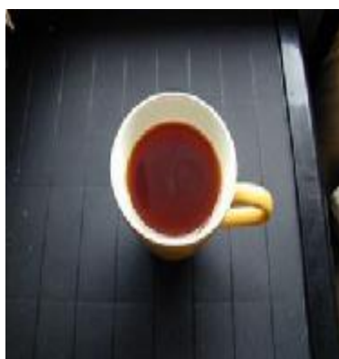
A strong cup of black tea for a cold winter morning