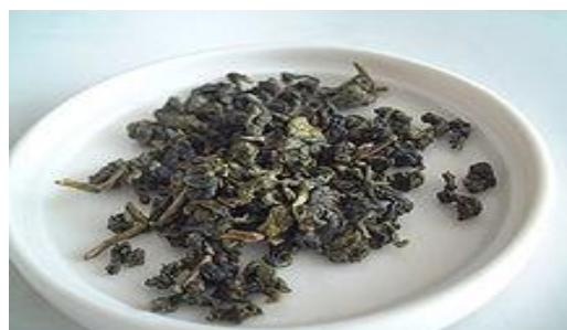
Rolled Oolong Tea Leaves

The origin of Oolong Tea is from continental China and Taiwan. The two most famous harvests "oolong fancy" or "black dragon", spotted with white dots, and ding dong , originally from the mountain bearing its name.