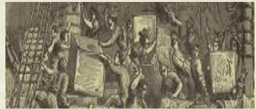
The Boston Tea Party-Destruction of the tea in Boston Harbor, 1773

to tax. The colonists were not going to be part of this taxation. So the colonists staged the Boston Tea Party on December 16, 1773 between the hours of 7:00 and 10:00 pm and literally threw tea crates over the side of 3 ships laden with tea. They destroyed over 345 chests of tea and in today's economy was worth about $1,700,000.