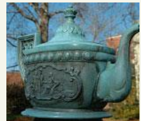
Marker Commemorating the 1774 event