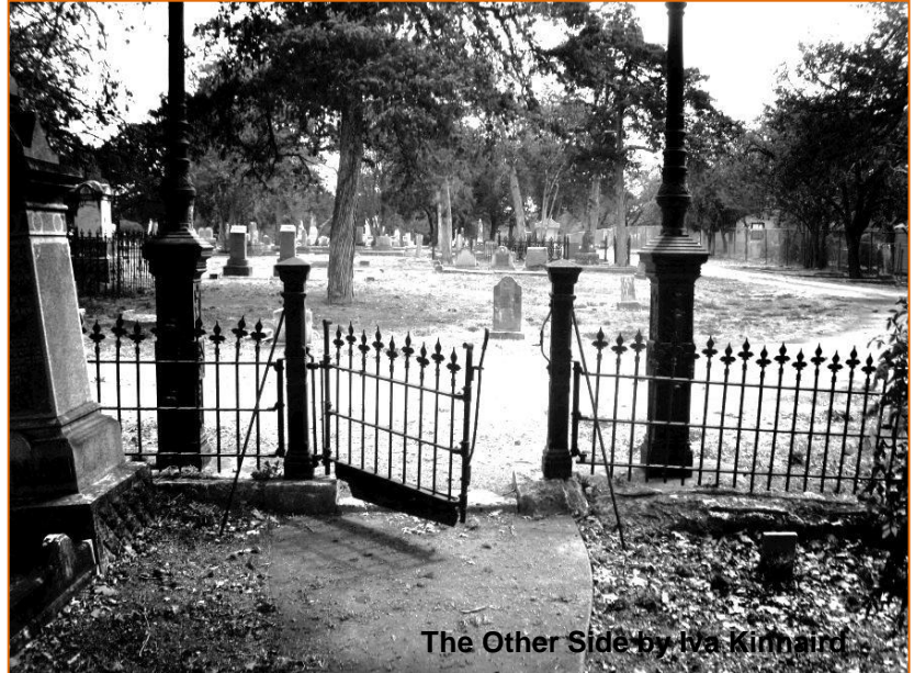
The Other Side by Iva Kinnaird

THANK YOU to all those shutterbugs who entered the contest and CONGRATULATIONS to those photos that received the top votes. Thanks for helping SAC increase public awareness and appreciation of the artistic and cultural value of Austin's city cemeteries.